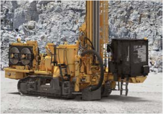
Model: CAT MD6200 QTY: 4