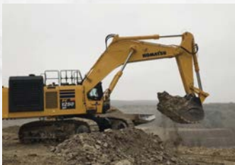
Model: Komatsu PC 1250-8 Capacity: 120 tons QTY: 10