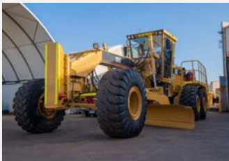
Model: CAT 16 H QTY: 1