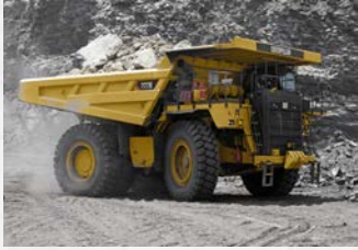
Model: CAT 777E Capacity: 100 tons QTY: 28