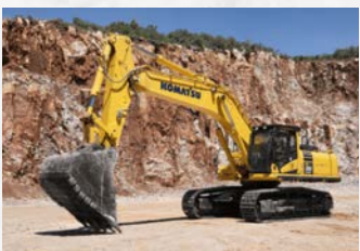
Model: Komatsu PC 500 Capacity: 50 tons QTY: 1