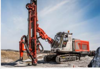
Model: Sanvic Pantera DP 1500 QTY: 3