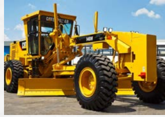
Model: CAT 140 H QTY: 2