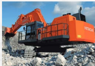
Model: Hitachi EX 1200-6 Capacity: 120 tons QTY: 3