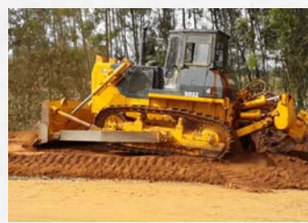
Model: Shantui SD22 QTY: 1