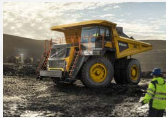
Model: Volvo R100E Capacity: 100 tons QTY: 6