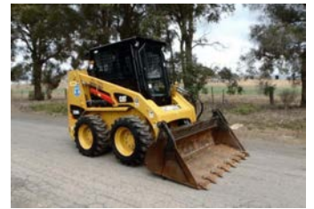
Model: CAT 226 B3 QTY: 3