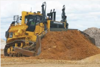
Model: Komatsu D375-A QTY: 1