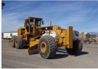
Model: CAT 16G QTY: 2