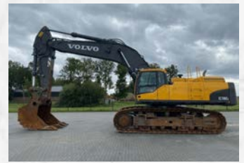
Model: Volvo EC 700 Capacity: 70 tons QTY: 15