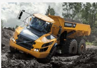
Model: Volvo A 40 G Capacity: 35 tons QTY: 10