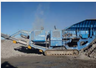
Model: Terex Jaw Crusher - XA400 Capacity: 300 TPH QTY: 2