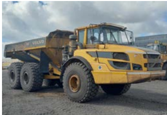
Model: Volvo A40 F Fuel Truck Capacity: 30,000 Litres QTY: 2