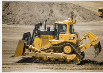
Model: CAT D9T QTY: 1