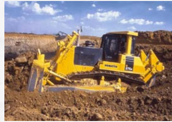
Model: Komatsu D275-A QTY: 9