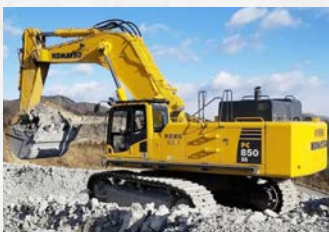
Model: Komatsu PC 850 Capacity: 85 tons QTY: 2