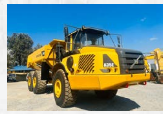
Model: Volvo A 35 E Capacity: 35 tons QTY: 3