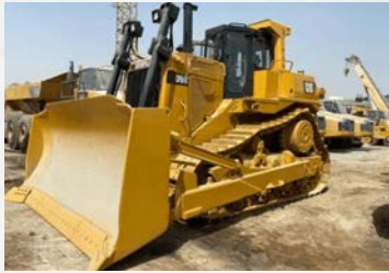
Model: CAT D9R QTY: 15