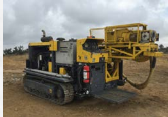
Model: Atlas Copco CS 14 QTY: 3