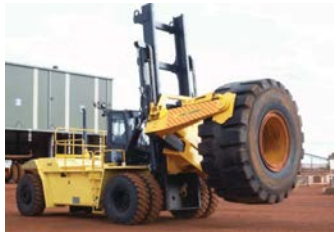
Model: Hyundai Tyre Handler H770 QTY: 1