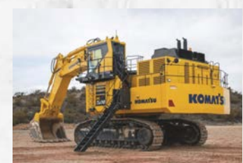
Model: Komatsu PC 2000 Capacity: 200 tons QTY: 4