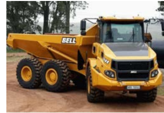
Model: Bell B18E Fuel Truck Capacity: 18,000 Litres QTY: 3