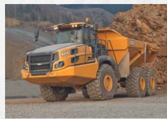
Model: Bell B 40 E Capacity: 40 tons QTY: 14