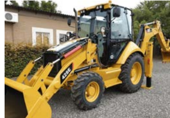
Model: CAT TLB 428 E QTY: 3