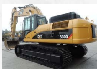
Model: CAT 330D Capacity: 30 tons QTY: 2