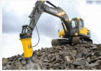
Model: Volvo EC 460 Capacity: 4 tons QTY: 3