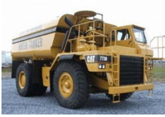
Model: CAT Water Bowzer 773B Capacity: 60,000 Litres QTY: 2