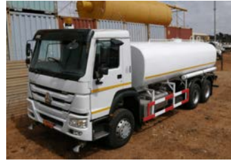
Model: Howo Sino Water Cart Capacity: 20,000 Litres QTY: 6