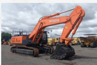
Model: Hitachi ZX470 Capacity: QTY: 1