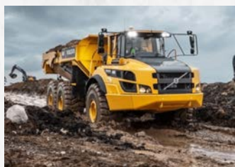
Model: Volvo A 40 E Capacity: 40 tons QTY: 26