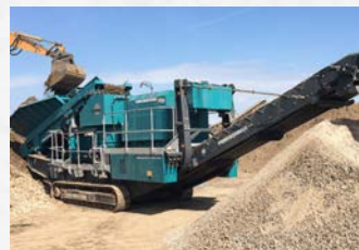
Model: Terex Cone Crusher - 1000SR Capacity: 250 TPH QTY: 1