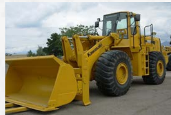
Model: Kawasaki 90 Z QTY: 2