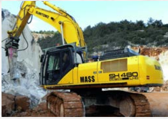
Model: Sumitomo SH 480 Capacity: 4 tons QTY: 3