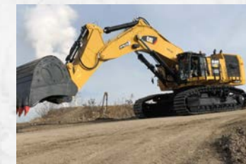
Model: CAT 6015 Capacity: QTY: 1