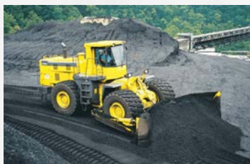
Model: Komatsu WD600 QTY: 2