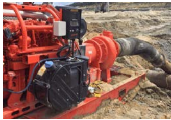
Model: Volvo Water Pump Capacity: 100 Head QTY: 2