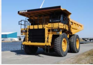
Model: CAT 777D Capacity: 100 tons QTY: 16