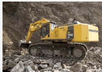
Model: Komatsu PC 700 Capacity: 70 tons QTY: 2