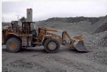
Model: Caterpillar 988H QTY: 1