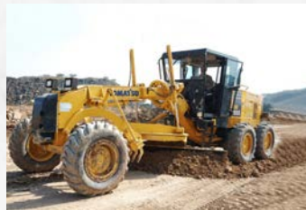
Model: Komatsu GD825 QTY: 3