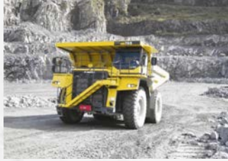
Model: Komatsu HD 785-7 Capacity: 100 tons QTY: 15