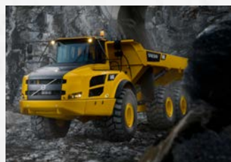
Model: Volvo A 40 F Capacity: 40 tons QTY: 4