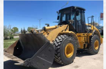
Model: Caterpillar 950H QTY: 1