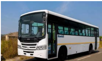
Model: TATA Bus Capacity: 52 Seats QTY: 10