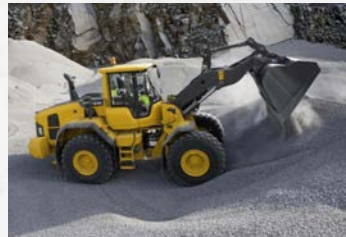
Model: Volvo L 120G QTY: 1