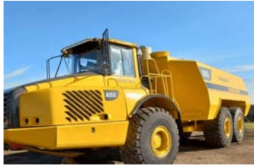
Model: Volvo Water Bowzer A30D Capacity: 27,000 Litres QTY: 2