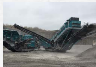
Model: Chieftain Power Screen - CH1700 Capacity: Triple Deck QTY: 2