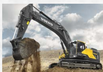
Model: Volvo EC 480/460 Capacity: 45 tons QTY: 5