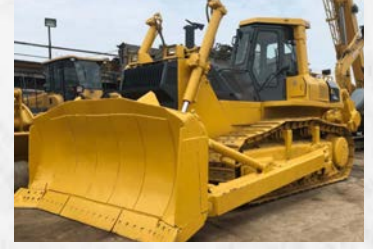
Model: Komatsu D155 QTY: 2