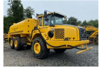
Model: Volvo Fuel Truck A30D Capacity: 27,000 Litres QTY: 3