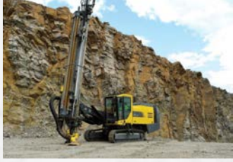
Model: Atlas Copco Roc L8-30 QTY: 2