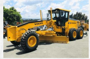
Model: Volvo GD 940 QTY: 1