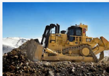
Model: CAT D10T2 QTY: 2