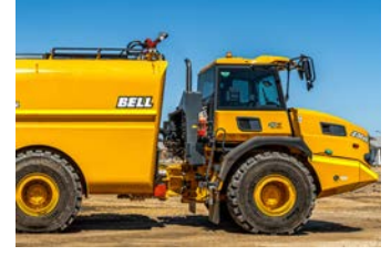
Model: Bell B40D Capacity: 30,000 Litres QTY: 2