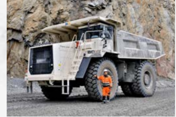
Model: Terex TR 100 Capacity: 100 tons QTY: 2