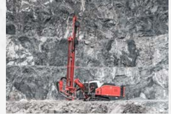
Model: Sanvic DL650i Leopard QTY: 2