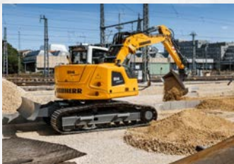
Model: Liebherr 914 Capacity: 14 tons QTY: 2