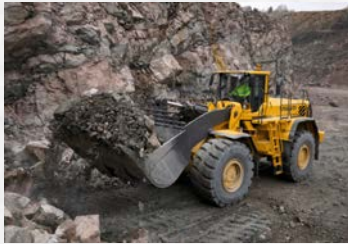
Model: Volvo L 350F QTY: 1