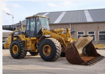
Model: Caterpillar 966H QTY: 1