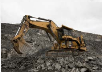
Model: CAT 60208 Capacity: 200 tons QTY: 2